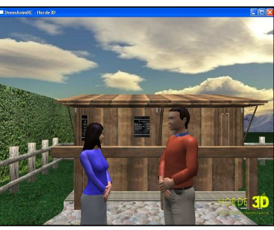
Figure 3. Culture specific agents in the Virtual Beergarden application (upper: Germany; lower: Japan)

To avoid side effects aroused by different gender combinations in the agent conversations or depending on the subjects' preferences we decided to show mixed gender combinations in the videos. Thus one female and one male agent interacted with each other.