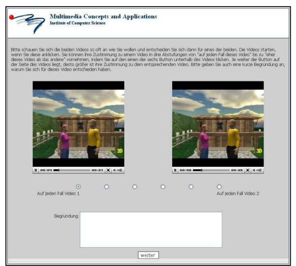
Figure 4. Screenshot of evaluation study, showing a pair of conversation videos displayed by Western-style agents

The third pair of videos showed a combination of our findings in the usage of pauses in speech and overlapping speech. Thus, the German video contained one pause that lasted for 1 second, one overlap that lasted for 0.3 seconds and two overlaps that lasted for 0.5 seconds. Accordingly the Japanese version contained two pauses that lasted for 1 second, one pause that lasted for 2 seconds, three overlaps that lasted for 0.3 second, one overlap that lasted for 0.5 seconds and one that lasted for 1 second.