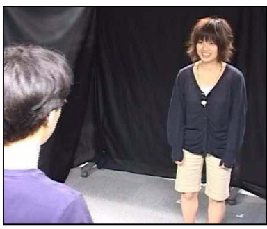
Figure 1. Example interaction in the empirical study (upper: Germany; lower: Japan)

For the CUBE-G project culture-specific nonverbal behaviour such as posture or expressivity of gestures was analysed (see Figure 1 for stereotypical body postures).